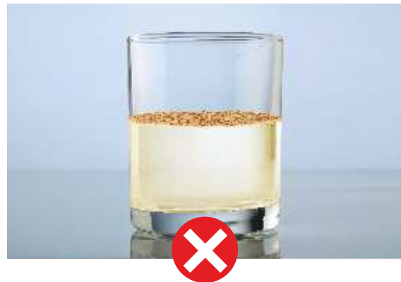
Excess bran in wheat flour