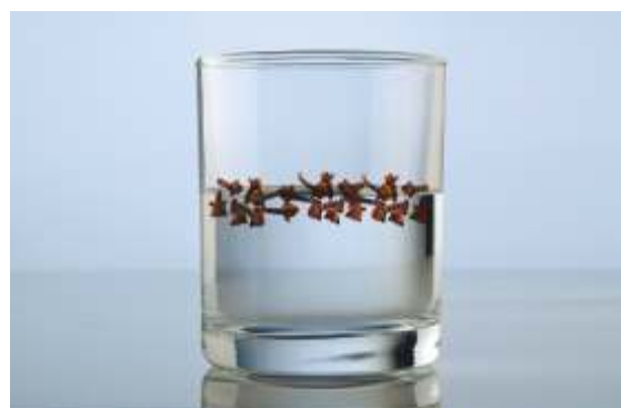
Volatile oil extracted cloves