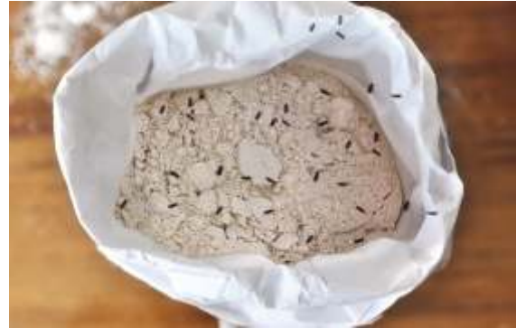
Sand, Soil, insects, webs, lumps, rodent hair and excreta