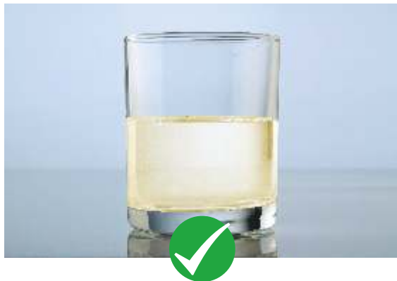
Pure wheat flour