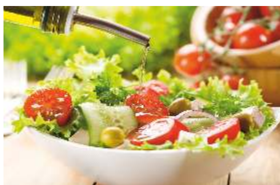
Refined winterized salad oils